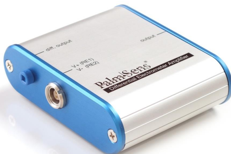
differential electrometer amplifier