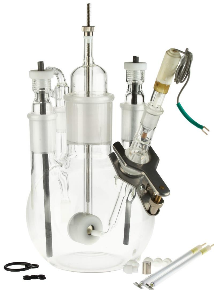
ITALSENS CORROSION CELL SET