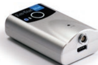
EmStat Blue potentiostat