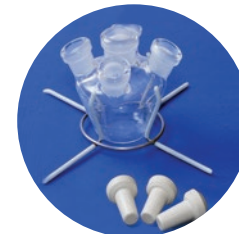
Glass cell with stoppers