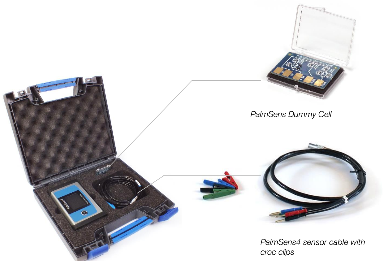
PalmSens4 standard configuration in case with accessories.

PStouch for PalmSens4 will be made available at the end of 2 nd quarter of 2017