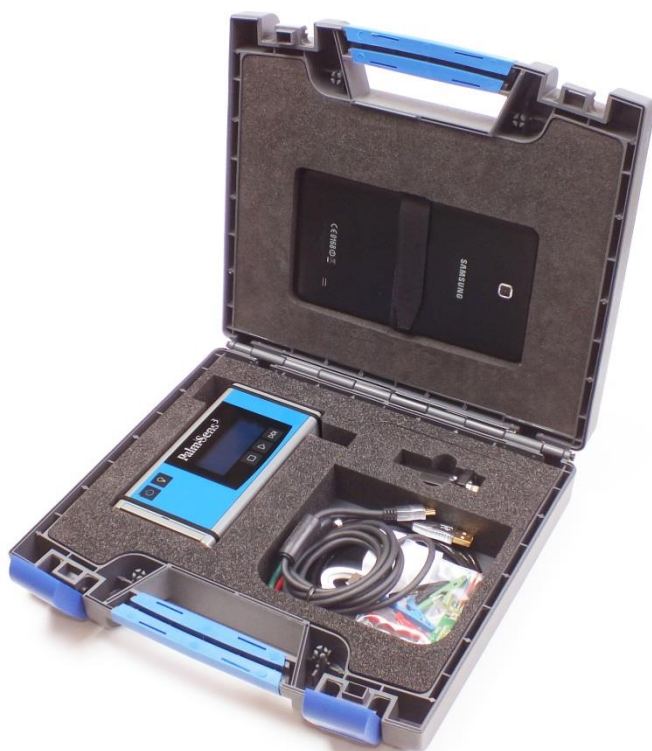
PalmSens3 in standard carrying case (showing optional tablet and Bluetooth extension)